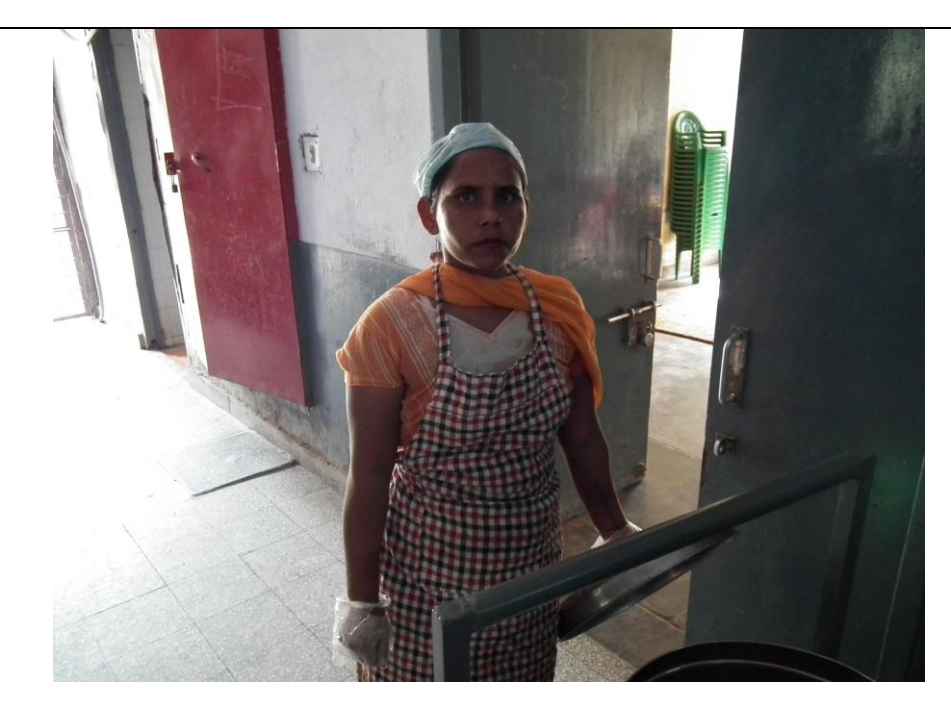
AN AAYA SERVING MDM IN GHS SECTOR-12