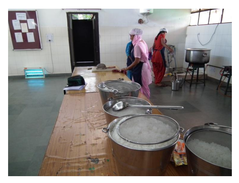
KITCHEN SHED (INSIDE VIEW) OF GMSSS, SECTOR-10

Infrastructure: The four supplying institutes have their own kitchen cum storage areas. Kitchen sheds have been constructed in 7 different Government schools i.e. GMSSS-10, GSSS-15, GMHS-38-D, GMHS-42, GMSSS-44, GMSSS-47, GMSSS-26 with facilities of storage for dry and wet ration etc. and the other three kitchen shed work i.e. GMSSS-23, GMHS-29, GMSSS-40 has been stopped by the administration as to start the seven constructed one and to check the response from these. The one kitchen shed located in GMSSS-10, on trial basis has been started and its running very well.