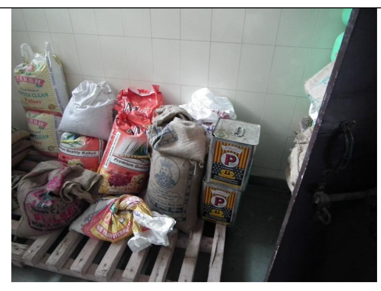
STORAGE ROOM OF KITCHEN SHED OF GMSSS, SECTOR-10