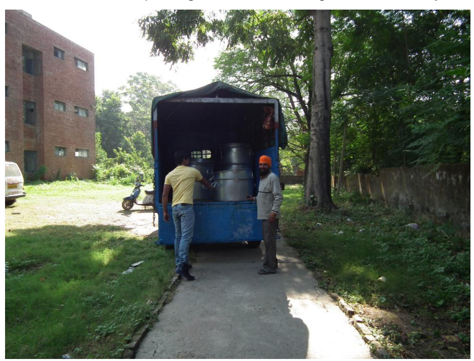
TRANSPORTATION OF FOOD IN SMALL TRUCKS TO SCHOOLS (GPS-SECTOR-12) FROM CENTRALISED KITCHENS

<u>Transportation of food:</u> The cooked meals are transported from the centralized kitchen to schools by trucks. The route is changed daily so that one particular school is not the privileged first school to get the food early.