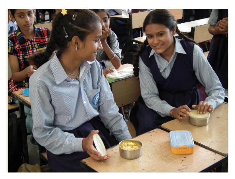
STUDENTS HAVING MDM IN GMSSS- SECTOR-10 (CLASSROOM)